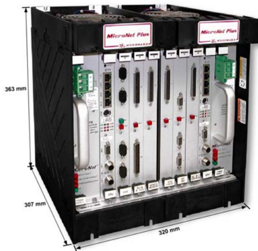
MicroNet Plus Control Chassis (8 VME slot option)

Power supplies may be simplex or redundant in any combination of input voltages.