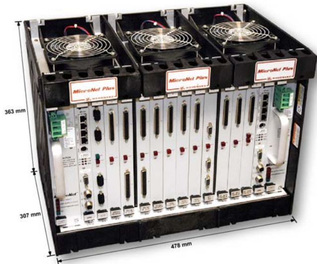
MicroNet Plus Control Chassis (14 VME slot option)