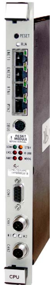
MicroNet Plus CPU5200

The MicroNet Plus system is capable of running in a redundant master / standby configuration to provide higher availability. Synchronized memory assures that both CPUs use the same operating information in every rate group. If the master CPU becomes inoperable, full system control, including control of the I/O, is transferred to the standby CPU in less than 1 ms without affecting prime mover operation. After correcting the master CPU fault, the system can continue running on the standby CPU, or control of the system can be transferred back to the original master CPU. Annunciation of any control transfer is given through communication links.